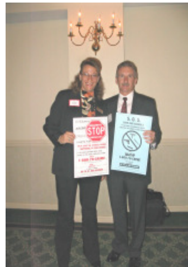
New Jersey School Boards Association Insurance Group has effectively and successfully provided the WeTip program to all of their insurance group members. Districts have enthusiastically embraced the WeTip anonymous School Safety program.

A united effort between CNA Insurance, Moreton & Company Insurance and WeTip has provided the School Safety Program to 102 school district throughout the state of Idaho. Many insurance companies and JPA groups are taking the initiative in providing the WeTip Program to reduce crime and loss in schools throughout the nation.