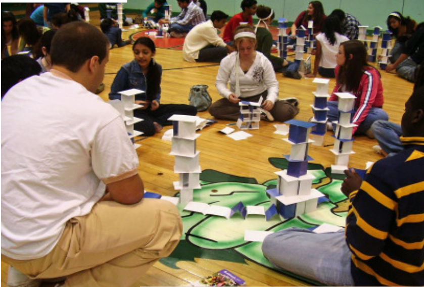
Students at JFK High School in Woodbridge, New Jersey build tower communities in a united effort and then identify the threats and risk that may affect their schools and neighborhoods.